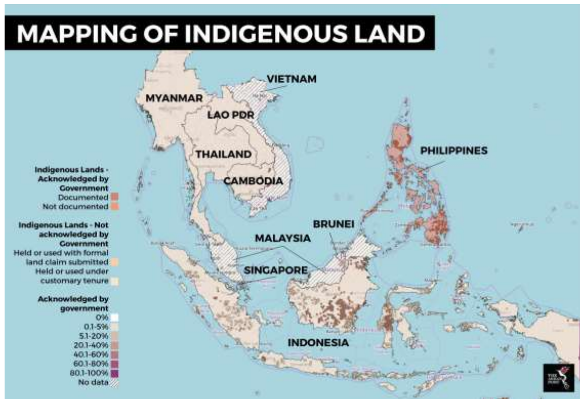
Figure 2. Mapping of Indigenous Land in Southeast Asia Countries

Furthermore, indigenous communities frequently encounter limited access to economic prospects. Exclusion from land ownership and employment opportunities may be a possibility for them. The absence of economic prospects poses a challenge for indigenous communities in safeguarding their territories and natural assets against corporate and governmental entities.